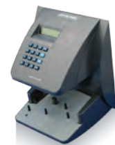
PC Fingerprint Reader